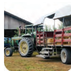
Farms and Ranches