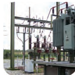
Power Transmission and Distribution